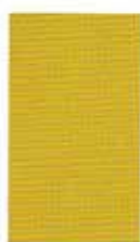
أصفر وسط JAAUNE MOYEN AMARELO MEIO MEDIUM YELLOW [816] 002