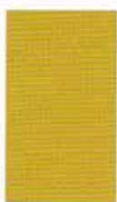
أصفر غامق JAUNE FONCÉ AMARELO SÓLIDO THICK YELLOW [815] 003