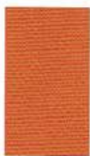
برتقالي ORANGE LARANJA ORANGE [808] 009