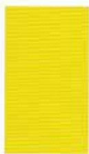
أصفر JAUNE AMARELO FAST YELLOW [803] 001