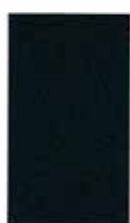
أخضر VERT VERDE FAST GREEN [805] 007